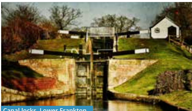
Canal locks, Lower Frankton

Queen's Head at this point provides a good halfway refreshment stop with a pub of the