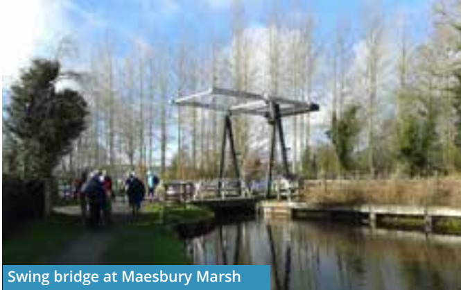
Swing bridge at Maesbury Marsh

Much of this stage is along canal towpath, a permissive right of way without the need for extensive way-marking; you can't go wrong! However you may find restoration work still going on in some places so be prepared for a diversion if necessary.