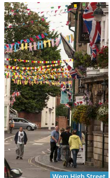
Wem High Street