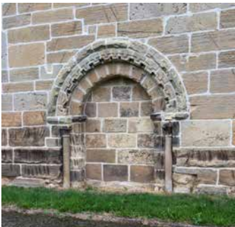
Norman doorway, St Mary's church in Astley

Parts of St Mary's church at Astley date from the 12th century and it has an interesting Norman doorway in the South wall. In the village of Hadnall the path passes alongside the remains of a moat where a timbered