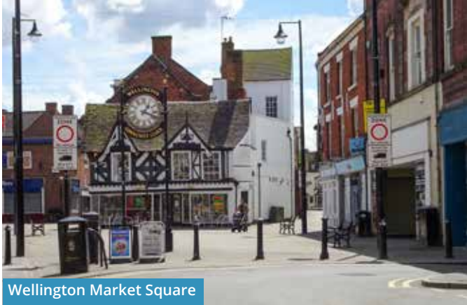
Wellington Market Square