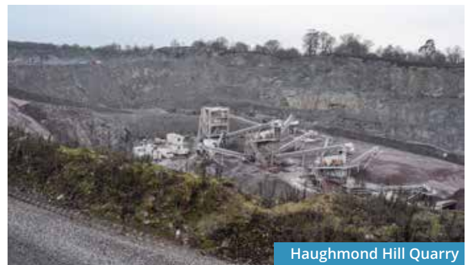
Haughmond Hill Quarry

It is possible to get information and a unique sight of the quarry workings from a viewing platform on your way to the Forestry Commission carpark. Refreshments are available here.