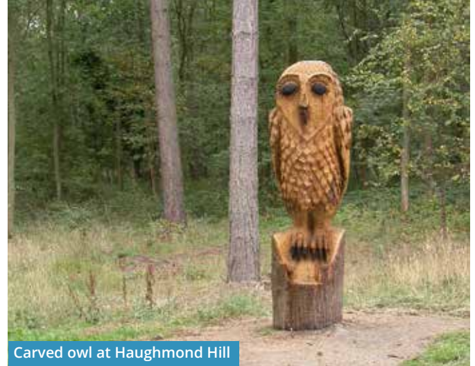
Carved owl at Haughmond Hill

Here the Shropshire Way Main Route joins the Silkin Way, a heritage walking & cycling route from Bratton in the North to Coalport in the South. It largely follows a green corridor created from dry canal beds and disused railway lines.