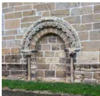
Norman doorway, St Mary's church in Astley

Parts of St Mary's church at Astley date from the 12th century and it has an interesting Norman doorway in the South wall. In the village of Hadnall the path passes alongside the remains of a moat where a timbered