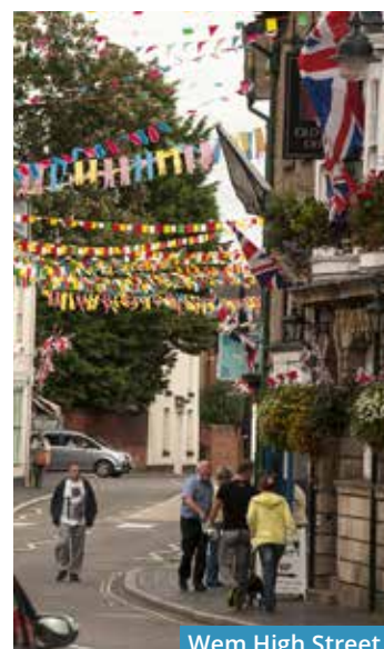
Wem High Street