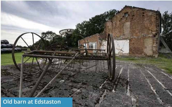
Old barn at Edstaston

A few miles north of Wem you will have the choice of continuing westwards to Ellesmere or north-eastwards on a linear route to Whitchurch.