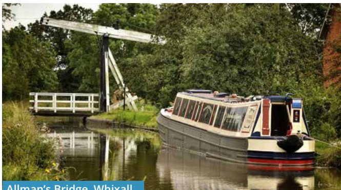
Allman's Bridge Whixall

The original Shropshire Way took a more direct northerly path to meet the Sandstone Trail at Grindley Brook. The revised route takes in Shropshire's wetland areas; Sites of Special Scientific Interest (SSSI) before reaching Prees Heath. This is the only site in the Midlands where you can see the silver studded blue butterfly from mid-June to late July. Further on and nearer to Whitchurch, Brown Moss SSSI is designated as a Local Nature Reserve. This is one of Shropshire's most important places for plants, with over 200 species of native